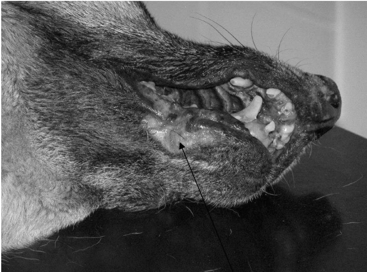
FIG. 1. Chronic labial ulceration of the dog. The arrow points out the ulceration.

contact with dairy livestock or unpasteurized dairy products. However, she had a dog with at least a 3-year history of chronic labial ulceration, sneezing, and rhinorrhea (Fig. 1). It used to burrow in the ground. C. ulcerans strain was recovered from the tonsils, nose, and labial ulcerations of the animal. This strain could have been responsible for the chronic ulcerations but could have been considered as a colonizing agent of these chronic lesions. Automated ribotyping by using the Ribo-Printer (Qualicon, Wilmington, Md.) and the endonucleases BstEII and PvuII demonstrated that the patient and dog isolates corresponded to a single strain that was different from collection strains of C. ulcerans (Institut Pasteur, Paris, France) (Fig. 2). An amoxicillin-containing treatment (2 g/daily during 15 days) failed to eliminate the bacteria from the dog, and the animal was euthanized. Histopathologic examination of the dog tonsils showed gram-positive, coryneform rods partly arranged in palisades without sign of necrosis.