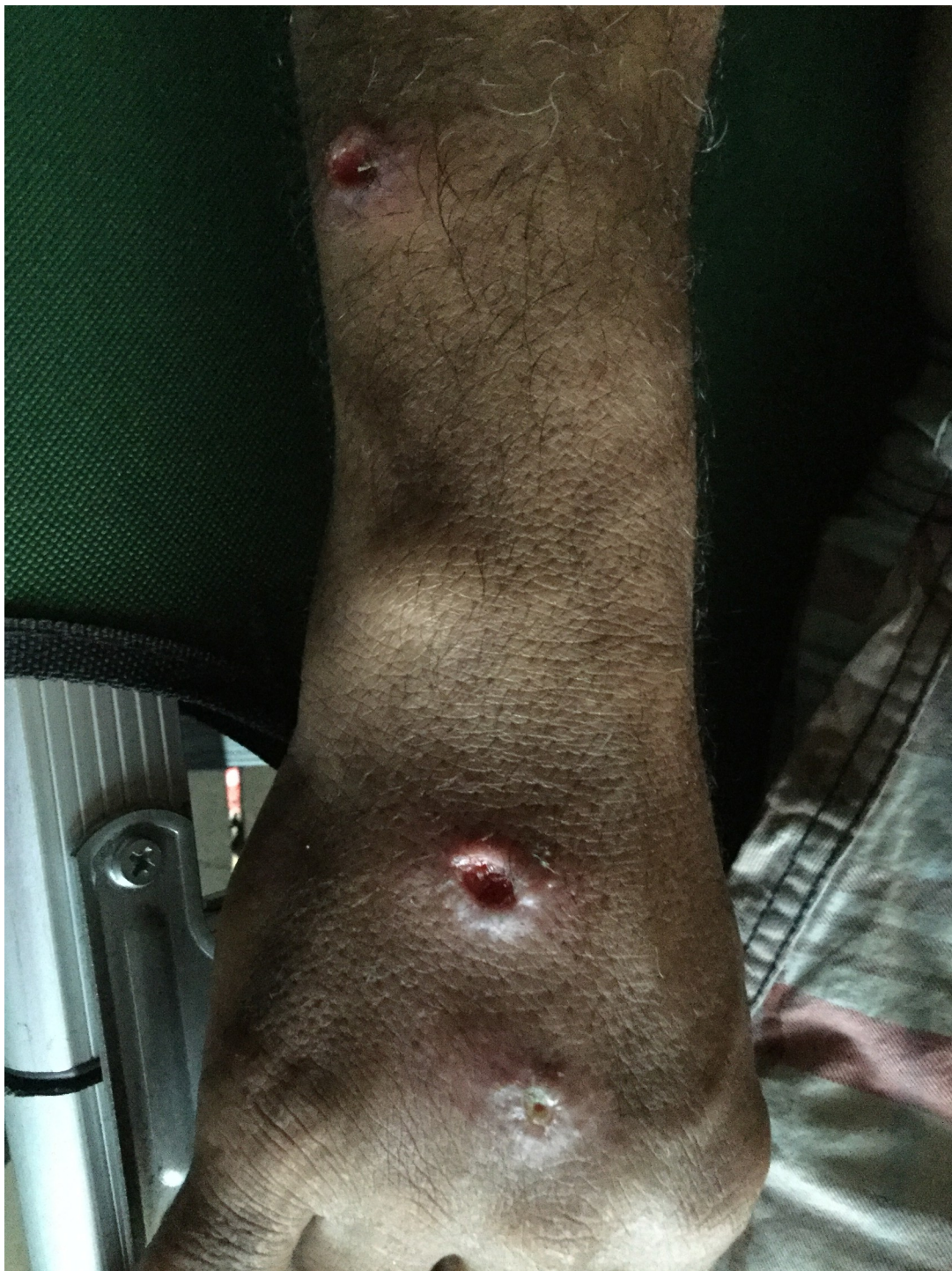
Fig 2. Three cutaneous leishmaniasis lesions on a gold miner included in the 2019 study.

https://doi.org/10.1371/journal.pntd.0010326.g002