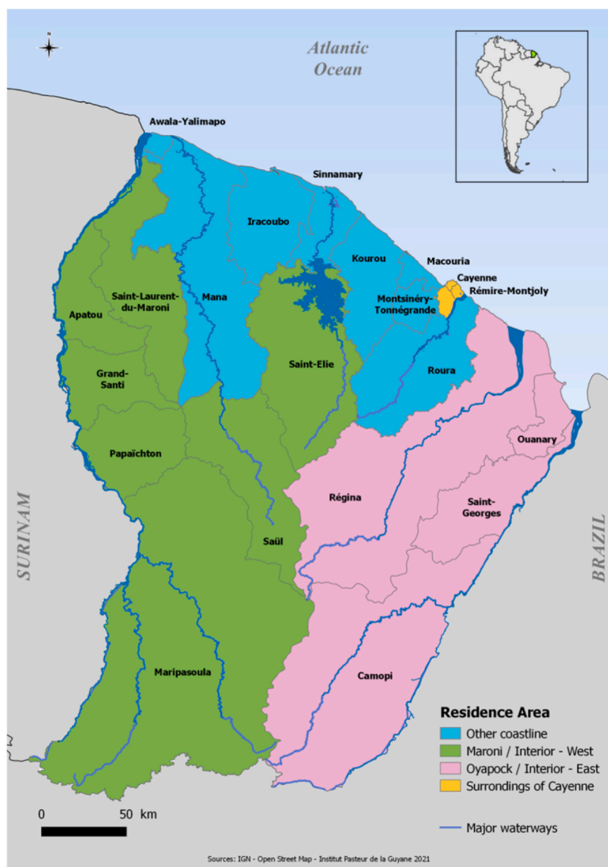
Fig. 1. Map showing the main study locations for this survey and the division of the field into four zones.

the SARS-CoV-2 vaccine was not effective at all (89.4% [77.8; 95.3]). Furthermore, most of them perceived the vaccine to be not at all safe, meaning it had significant potential side effects (92.4%, P = 0.0029 ). Participants' level of vaccine information was not significantly correlated with the use of herbal remedies.