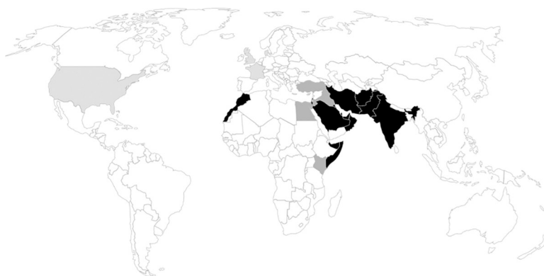
Fig 1. Geographical distribution of Rhinocladiella mackenziei cerebral phaeohyphomycosis (N = 36). In black, countries with confirmed cases. In dark gray, countries with possible contamination. In light gray, countries where diagnoses were made but unlikely to be at risk for contamination (probable imported cases). If several countries were possibly incriminated, priority was given to the country with other confirmed cases if present; else, every country was considered as “possible contamination.” Articles used in this figure are reported in S1 Table. Map template can be found at https://www.freeworldmaps.net/powerpoint/ .

So far, most of the cases found in the literature originated from the Middle East (24/36, 67%; Fig 1, S1 Table). However, recently, an increasing number of cases have been reported from other countries at risk, notably Pakistan, India [15], and, now, Morocco, which still concurs with the hypothesis of an organism fitted for an arid climate. Similar organisms have been isolated from air biofilters, dry, and/or acidic soil [16]. An analysis of the literature allows formulating new hypotheses about the pathogenesis of R. mackenziei cerebral phaeohyphomycosis. Reading the case from Cristini and colleagues [10], with a 20-year gap between the patient's stay in Afghanistan and the disease, one can assume the possibility of a latent in vivo reservoir, which ultimately reactivates under particular circumstances. Many patients in the literature have a travel history to areas with arid climates. If we hypothesize a prolonged carrier