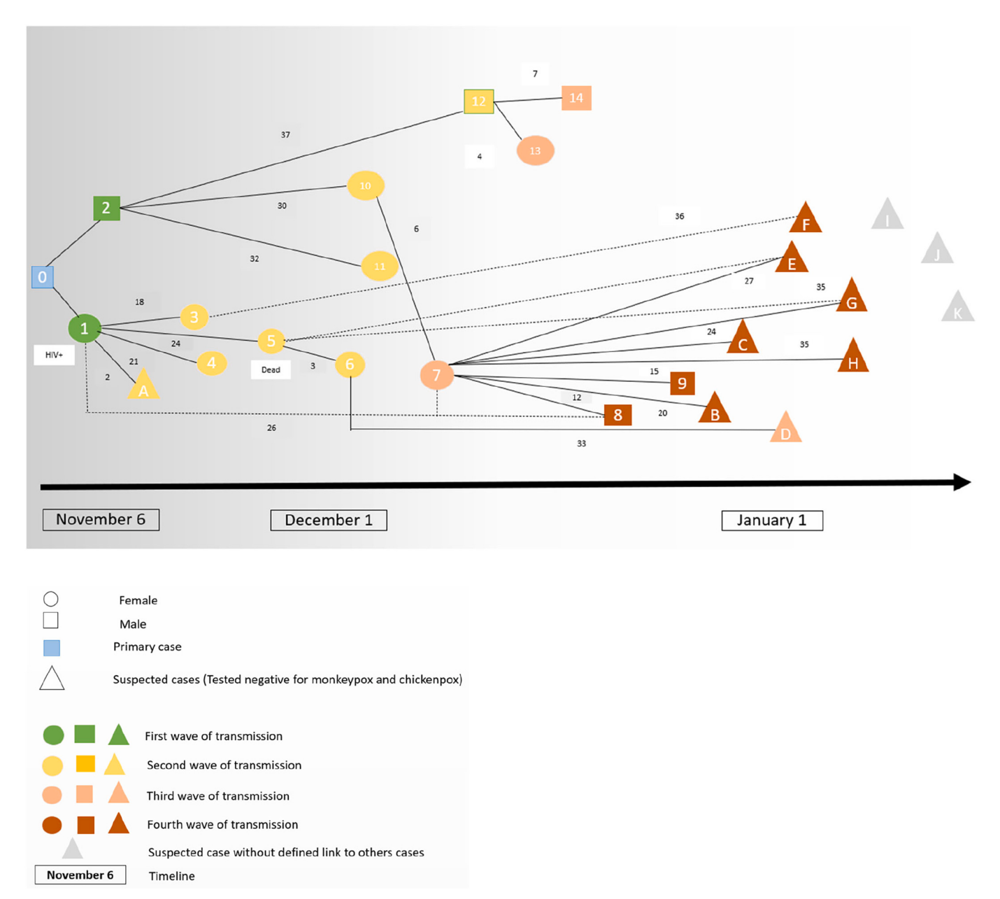
Fig. 2. Hypothetic pattern of monkeypox virus transmission during the Bania outbreak, CAR 2021–2022.

Circles correspond to female individuals, squares to male individuals, and triangles to suspected cases. Case 0 is the primary case. Cases are organized according to the date of illness onset and the four waves of transmission (first wave: green, second wave: yellow, third wave: coral, fourth wave: brown). The numbers indicate the number of days between disease onset in two consecutive patients in the line of transmission (rash-to-rash interval). The dotted lines correspond to less reliable presumed chains of transmission. The solid lines correspond to more reliable chains of transmission. (For interpretation of the references to colour in this figure legend, the reader is referred to the web version of this article.)