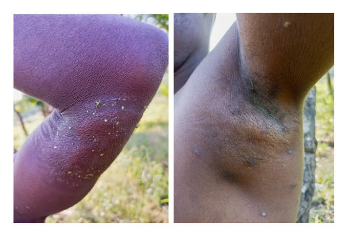
Fig. 4. A. Cutaneous abscess in a confirmed case of mpox, Bania, CAR, 2021–2022.

B. Axillary adenopathy in a different confirmed case of mpox, Bania, CAR, 2021–2022.