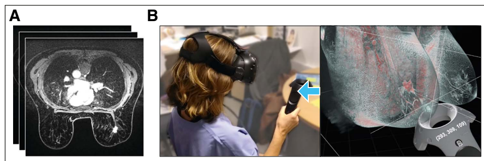
FIG 1. Two medical image visualization modalities used in this study: (A) slice-based visualization of MRI scan using viewing feature available with the hospital PACS and (B) immersive visualization using DIVA. The surgeon uses VR to grasp and interact with the 3D patient avatar. MRI, magnetic resonance image; PACS, Picture Archiving and Communication System; VR, virtual reality.

For the determination of the number of lesions, 66.7% of the residents determined this information correctly using the slice-based visualization. This percentage was 75% using the DIVA system ( P = .49 ). For experienced surgeons,