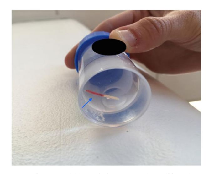
FIGURE 1: The macroscopic haemorrhagic appearance of the medulla on the renal biopsy.