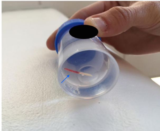
FIGURE 1: The macroscopic haemorrhagic appearance of the medulla on the renal biopsy.