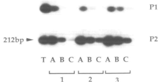
Figure 2. Analysis of strand specific DNA in the final PCR product. Probes P1 and P2 are specific for the desired and undesired DNA strands. Samples 1, 2 and 3 represent 10, 50 and 100 linear amplification cycles while A, B and C refer to initial Sp1A primer concentrations of 100, 1 and 0.1fmol/reaction respectively. The control lane (T) represents a classical amplification of the target sequences using the Sp1A/Sp2 primer pair.

A 25 \mu l aliquot of products from the 10, 50 and 100 linear amplifications was followed by 35 classical cycles of PCR. Two 10 \mu l samples from each of the final reactions were electrophoresed on a 1.5% agarose gel and transferred to nitrocellulose. One filter was hybridized with the radiolabelled P1 probe, the other with P2. The autoradiograms are shown in Figure 2. The band intensities have been normalized to the control which contained an equimolar proportion of the two sequences as amplified by the Sp1A and Sp2 primer pair alone. As can be seen the signal intensities were much stronger using the P2 probe as opposed to the P1 probe. In order to quantitate precisely the proportion of the two strands the products from 3A, 3B and 3C (100 linear cycles) were cloned into the EcoRI and HindIII sites of M13mp18 RF DNA. The recombinant plaques were screened