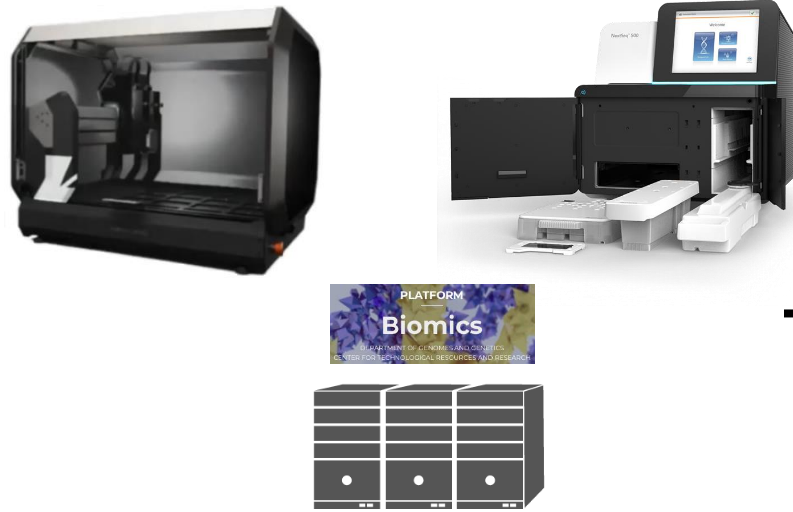
1. A dedicated sequencing platform, BioIT infrastructure and pipeline

We present the research environment, including sequencing and analyzing tools, molecular and cellular biology, virology, histology and entomology resources, that promotes the exploration of novel or unexpected pathogens identified from patient samples.