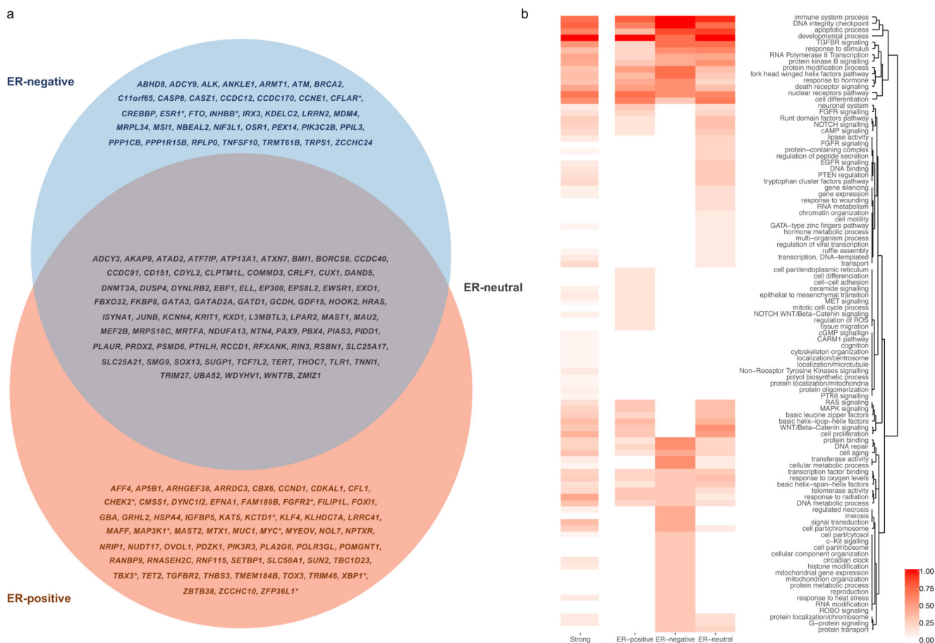
Figure 4. Predicted target genes are enriched in known breast cancer driver genes and transcription factors.

79 target genes that fulfil at least one of the following criteria: are targeted by more than one independent signal, are known driver genes, transcription factor genes, or their binding sites (ChIP-Seq BS) or consensus motif (TF Motif) are significantly overlapped by CCVs.