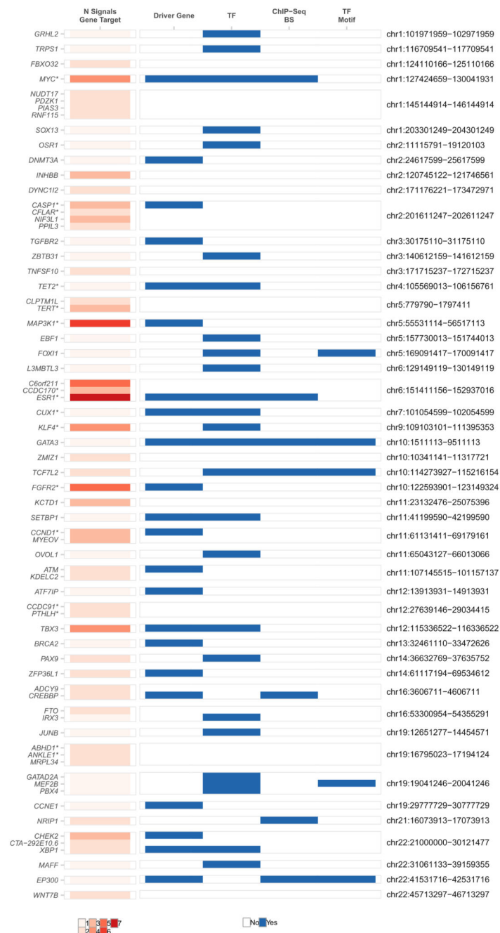
Figure 5. Predicted target genes by phenotype and significantly enriched pathways.

(a) Venn diagram showing the associated phenotype (ER-positive, ER-negative, ER-neutral) for the Level 1 target genes, predicted by the CCVs and HPPVs. * ER-positive or ER-negative target genes also targeted by ER-neutral signals. (b) Heatmap showing clustering of pathway themes over-represented by INQUISIT Level 1 target genes. Color represents the relative number of genes per phenotype within enriched pathways, grouped by common themes. ER-positive, ER-negative, ER-neutral, and all phenotypes together (strong).