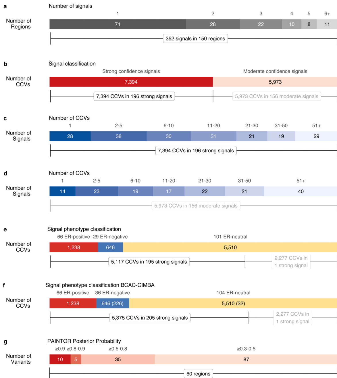
Figure 2. Determining independent risk signals and credible candidate variants (CCVs). (a) Number of independent signals per region identified through multinomial stepwise logistic regression. (b) Signal classification according to their confidence into strong and moderate confidence signals. (c) Number of CCVs per signal at strong confidence signals identified through multinomial stepwise logistic regression. (d) Number of CCVs per signal at moderate confidence signals identified through multinomial stepwise regression. (e) Subtype classification of strong signals into ER-positive, ER-negative and signals equally associated with both phenotypes (ER-neutral) from BCAC analysis. (f) Subtype