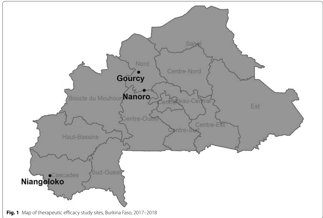
Fig. 1 Map of therapeutic efficacy study sites, Burkina Faso, 2017–2018

Children aged between 6–59 months with fever or history of fever in the previous 24 h seeking treatment at the targeted health facilities were examined by nurses and tested for malaria with a rapid diagnostic test (RDT) (Malaria Ag Pf/Pan, SD Bioline). Children with a positive RDT and no other illness requiring immediate attention were referred to the study team for screening procedures including clinical examination and malaria microscopy. Children were enrolled in the study if the following criteria were met: (a) mono-infection with P. falciparum detected by microscopy, (b) asexual parasite count of 2000–200 000/μl, (c) axillary temperature ≥ 37.5 °C or reported fever during the previous 24 h, (d) haemoglobin level ≥ 5 g/dl, (e) ability to swallow oral medication, (f) ability and willingness of caregivers to comply with the protocol for the duration of the study, (g) no history of effective anti-malarial treatment in the preceding 72 h and (h) written informed consent of a parent or guardian. Other selection criteria were evaluated according to the WHO standardized protocol [7]. Children who did