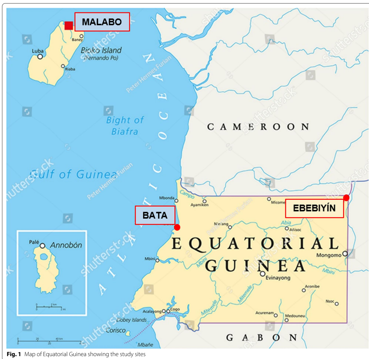
Fig. 1 Map of Equatorial Guinea showing the study sites

sequentially, first to ASAQ until sample size was reached and then to AL in each site, and assessed clinically and parasitologically for 28 days, based on the 2009 WHO protocol [20].