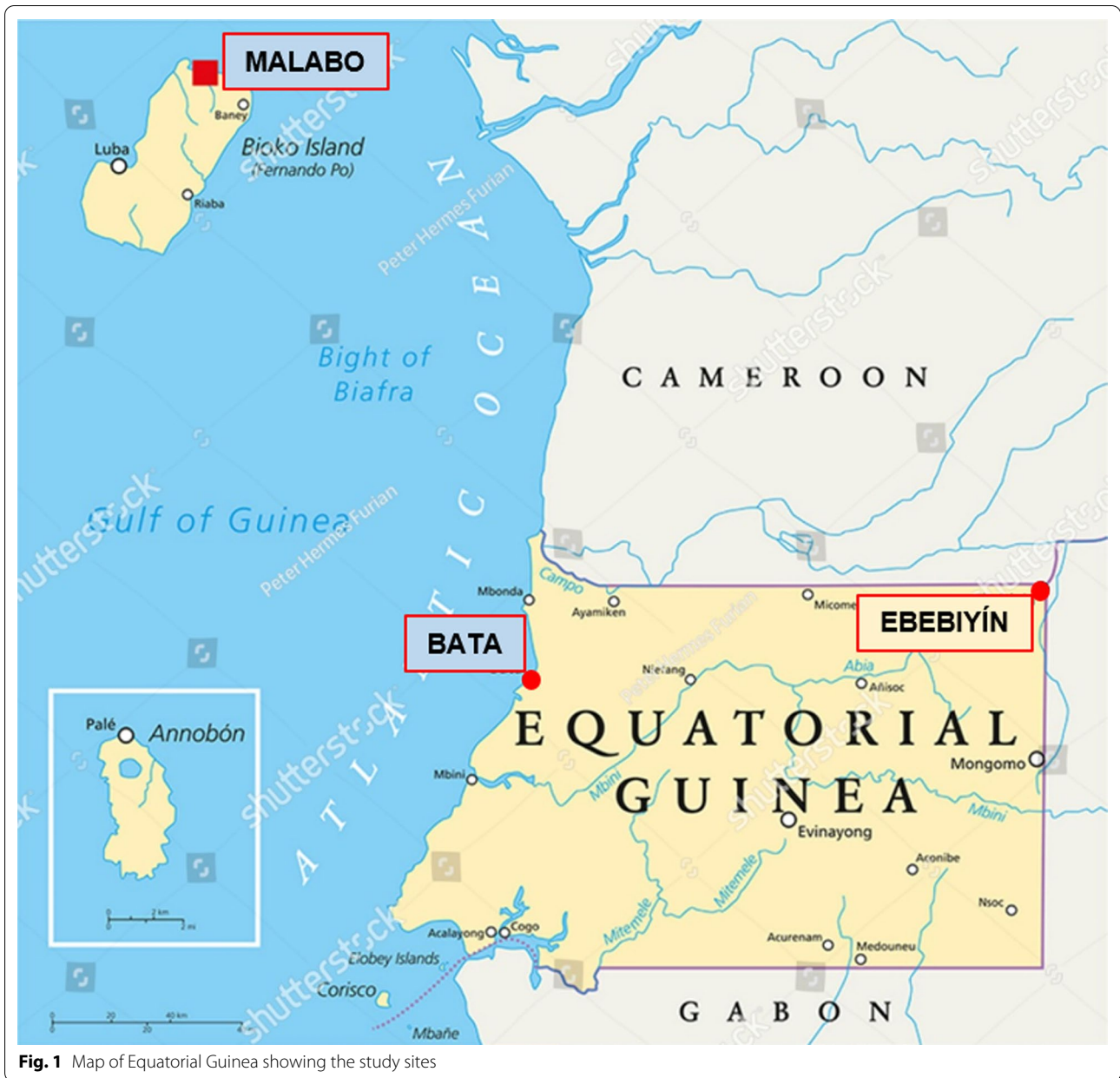
Fig. 1 Map of Equatorial Guinea showing the study sites

sequentially, first to ASAQ until sample size was reached and then to AL in each site, and assessed clinically and parasitologically for 28 days, based on the 2009 WHO protocol [20].