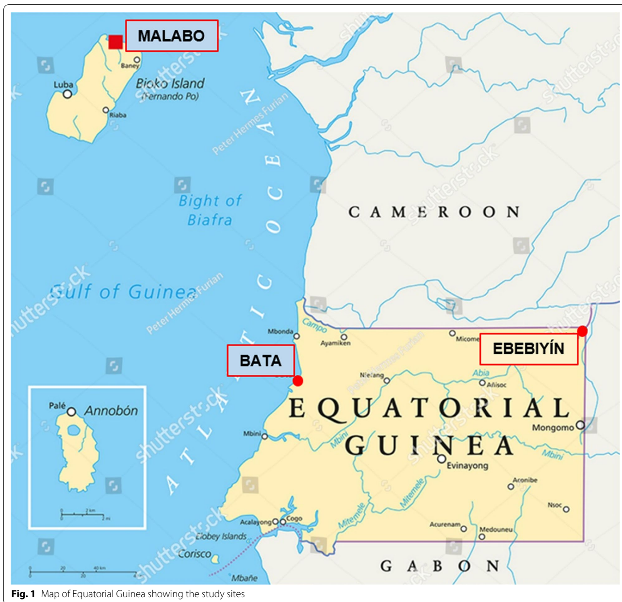
Fig. 1 Map of Equatorial Guinea showing the study sites

sequentially, first to ASAQ until sample size was reached and then to AL in each site, and assessed clinically and parasitologically for 28 days, based on the 2009 WHO protocol [20].