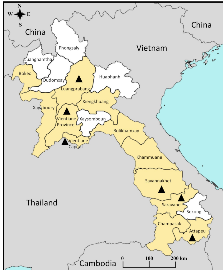
Fig 1. Map of Lao PDR. Provinces with DENV-2 reported cases are in yellow. Triangles indicate the localization of DENV-2 isolates which were sequenced in this study. This map was generated by IPL staff using Inkscape software free of copyright.

https://doi.org/10.1371/journal.pone.0237384.g001