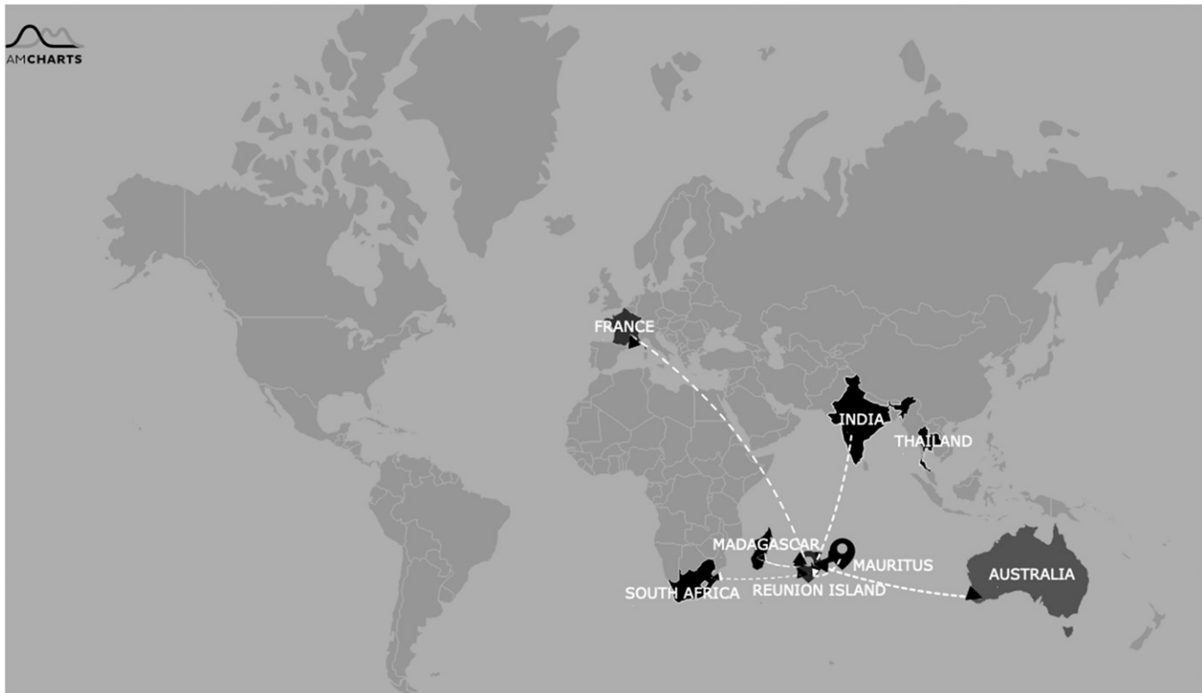
FIGURE 1. Indian Ocean region: Reunion Island is directly connected to European continent via several daily flights to Paris. White dotted line showed Reunion Island's daily flights.

blood and central venous catheter cultures). Caspofungin was prescribed for a period of 13 days (loading dose of 70 mg, followed by 50 mg/day). The persistence of positive blood cultures prompted the addition of liposomal amphotericin B (350 mg/day), after 5 days of caspofungin monotherapy. The diagnosis of C. auris endocarditis was made based on the discovery of vegetation of the mitral valve by transoesophageal echocardiography and the persistence of positive blood cultures until the patient died on day 19 from refractory intracranial hypertension. The species was confirmed at the National reference center for invasive mycoses and antifungals (NRCMA) (#Centre National de Référence des Mycoses Invasives et Antifongiques [CNRMA] 15.337). The isolate exhibiting high fluconazole MIC (> 64 mg/L) was found to belong to the Indian clade I.