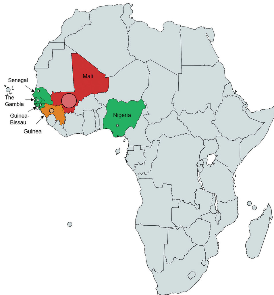
Figure 3. Geographic distribution of 13 patients infected by Nannizziopsis obscura in West Africa. The different colors represent the number of cases in each country: red for 7 cases, orange for 2 cases, and green for only 1 reported case. The diameter of the circle indicated for each country is proportional to the number of cases reported.

The issue of the portal of entry remains unclear. Subcutaneous nodules, ulcerative skin lesions, or both are frequently noted (e.g., in patients 2, 3, 4, 5,