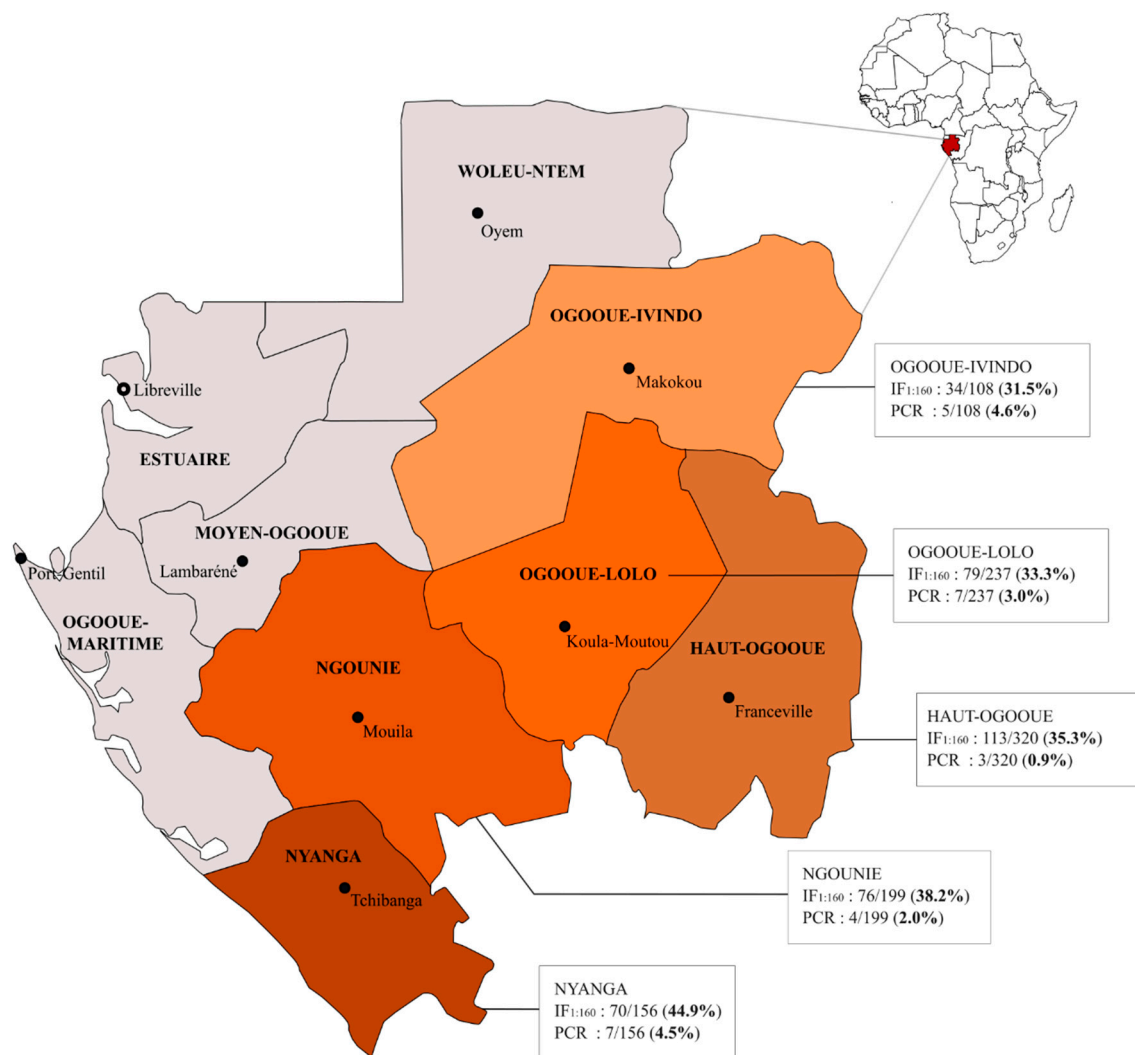
Figure 1. HHV-8 serological and molecular results in five studied provinces in Gabon.