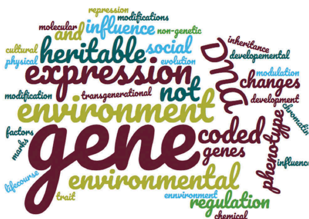
Figure 1. Word cloud built from the written answers to the survey (by using www.wordclouds.com ).

Unsurprisingly, it happened that the definition is not fixed, but rather broad and blurry. Importantly, when each discipline was asked to give a single word