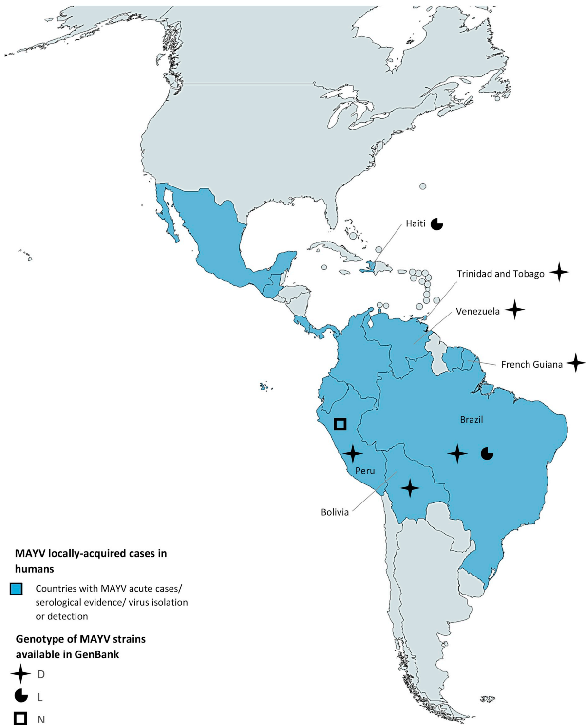
Fig. 2. Distribution of MAYV genotypes.

MAYV cases and MAYV genotypes are presented in Fig. 1 and Fig. 2