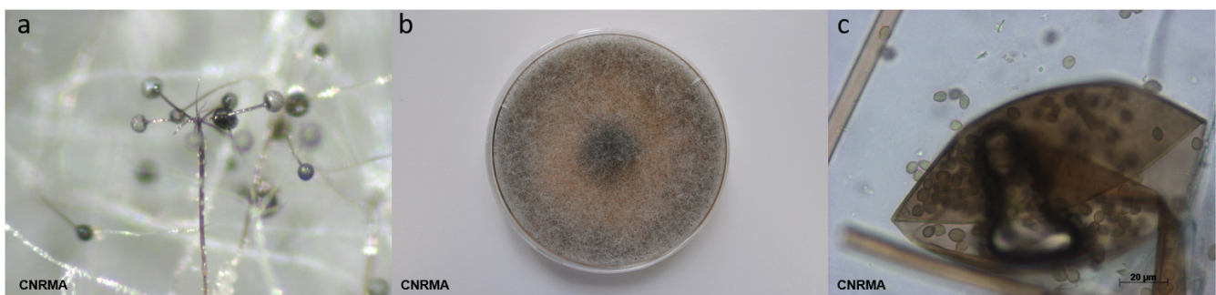
Figure 1. Typical features of Rhizopus arrhizus . (a) Sporangiophore branching and rhizoids (stereomicroscope); (b) grey-brownish colony on malt 2% medium; (c) melanized sporangium and sporangiospores.