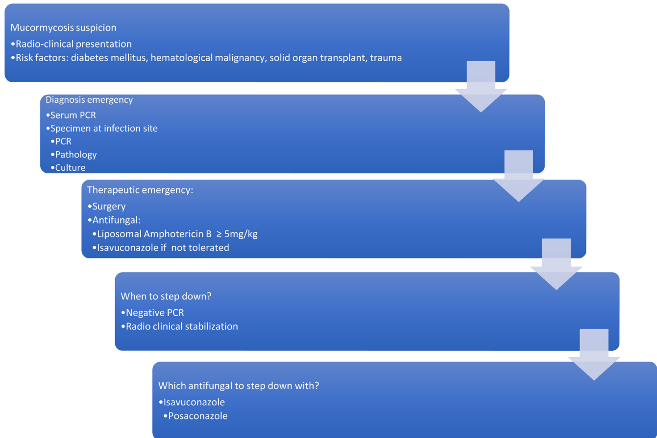
Figure 3. Mucormycosis: from suspicion to treatment. PCR, polymerase chain reaction.