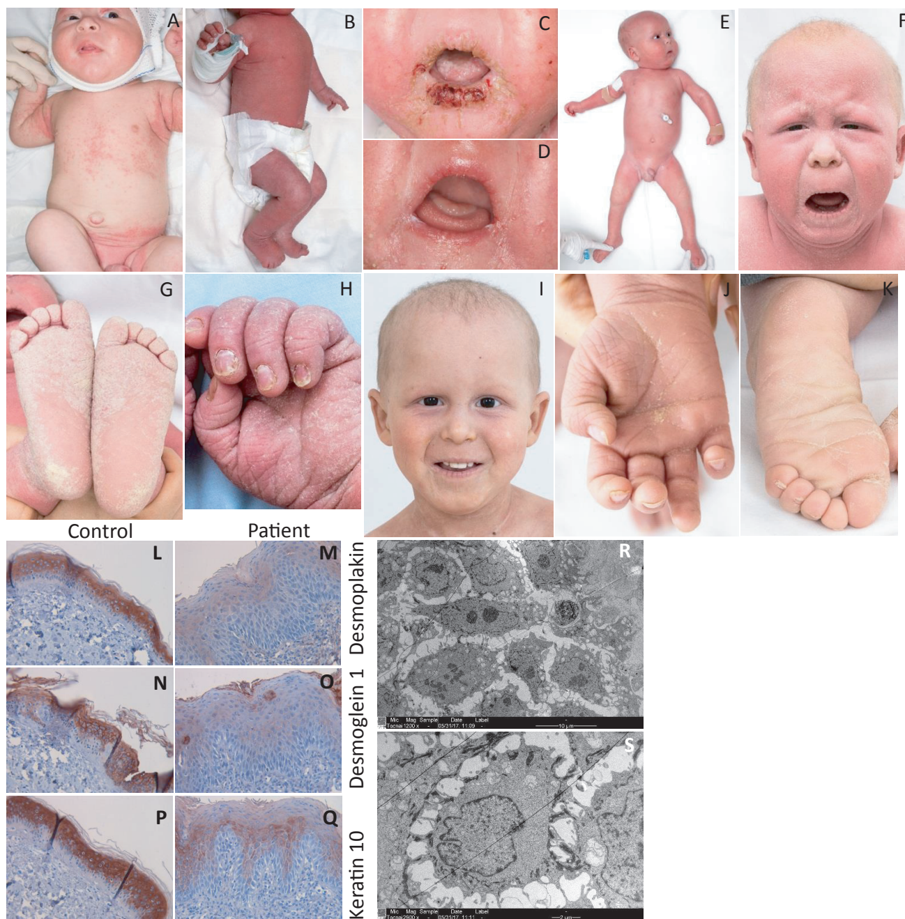
Fig. 1. Clinical features of the reported patient. (A) An intertriginous seborrheic like eczema at 2 weeks of age (B) evolved into a ichthyosiform erythroderma at 1.5 months. (C) Severe and relapsing HSV-1 stomatitis at 5 months and (D) a pyogenic granuloma on the tongue at 6 months. (E) Slight alleviation of scaling and erythema and hair regrowth after initiation of acitretin therapy at 7 months. (F) Ichthyotic erythroderma at 18 months with the development of (G) slight palmoplantar keratoderma (PPK) and (H) onychodystrophy. (I–K) Response to ustekinumab treatment at 25 months included hair regrowth and alleviation of skin scaling and PPK. DSP mutation leads to decreased levels of DSP, DSG1 and KRT10. (L) Skin tissue of a normal control shows prominent DSP antibody staining throughout the epidermis in suprabasal cells, while in the patient (M) only a weak staining is seen in the upper epidermis. DSG1 is distinct intercellularly in (N) healthy skin, but almost totally lost (O) in the patient. KRT10 stains intensely in (P) the suprabasal healthy skin, but is weak in the patient's upper epidermis and (Q) diminished in the suprabasal layers. Electron microscopy of the patient's skin biopsy samples shows the loss of intercellular cohesiveness, especially (R) suprabasally and decreased numbers of desmosomes and tonofilaments, as well as (S) the absence of perinuclear tonofilaments. Written permission from the parent.

tions since, while recurrent mucocutaneous HSV-1 flares have necessitated continuous acyclovir prophylaxis. IVIG substitution was stopped at 20 months. Acitretin was started at a low dose of 0.25 mg/kg every other day at 7.5 months (8). Acitretin slightly alleviated scaling, erythema and itch and induced hair regrowth (Fig. 1E).