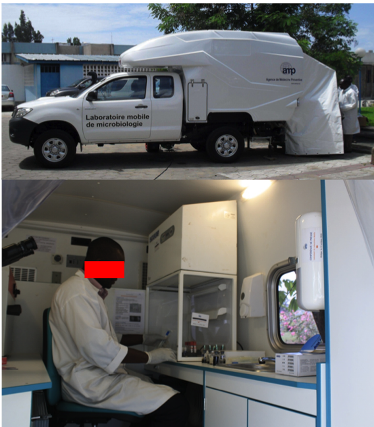
Figure 1. The exterior and interior of the LaboMobil®. doi:10.1371/journal.pone.0068401.g001

for Hi, lytA for Sp, siaD for Nm genogroups B, C, Y, X, and W135, and mynB for NmA. The Pasteur Institute, Paris, France performed molecular analysis according to European Meningococcal Disease Society (EMGM) recommendations [18,19] including PCR identification and genogrouping as well as testing for multilocus sequence typing (sequence type and clonal