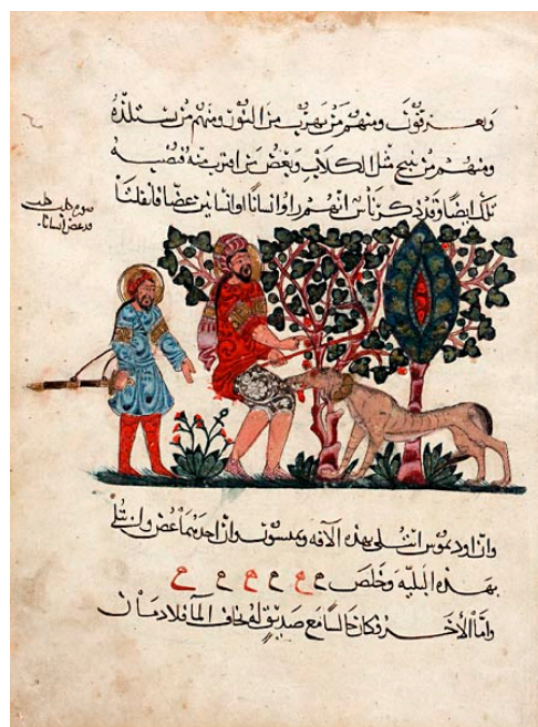
Figure 5. Outdoor scene with a mad dog biting a man. Folio from the ‘Kitab al-Hashaish’, an Arabic translation of the Materia medica by Dioscorides (ca. 40–90 C.E.) copied by Abdallah ibn al-Fadl, Baghdad, A.H.621/1224 A.D. Freer Gallery of Art and Arthur M. Sackler Gallery, Smithsonian Institution, Washington, D.C.: Purchase—Charles Lang Freer Endowment, F 1953.91.

Saint Hubert to dogs so they would not contract the disease [52,53]. An example of this amulet can be seen at http://www.webcitation.org/6os1x82Ty . Contrary to what was practiced in other reputed sites such as San Bellino [17], near present-day Rovigo in Italy, or in Saint-Tügen's chapel in Primelin, France, this method must have been considered too cruel or too unreliable in humans bitten by suspected rabid animals. In humans, the preferred method of rabies prevention after a bite was based on incision of the forehead and implantation of threads from the Saint's supposedly miraculous stole, accompanied by prayers and fasting [19,25,52–54]. In spite of Ambroise Paré—who after the siege of Turin in 1536 discontinued the practice of cauterization to heal wounds [55,56]—Dioscorides' and Celsus' cauterization approach remained widespread in the management of rabies risks well into the 19thC [31,57]. This may be because cauterization was performed to inactivate a “poison” and perhaps also because their work was never lost to practitioners in Europe in spite of the fall of the Roman Empire [58,59]. Patients, however, found little recourse should prevention fail: at Saint-Tügen chapel, patients with declared rabies were stifled between mattresses until the beginning of the 19thC.