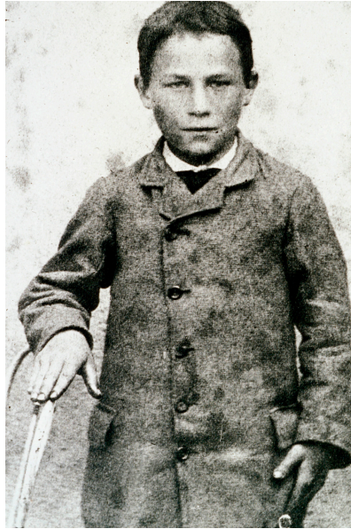
Figure 6. Joseph Meister in 1885, the first human to have received Pasteur’s live, attenuated rabies vaccine on July 6, 1885 (© Institut Pasteur-Musée Pasteur).

Vulpian. The first injection was derived from the chord of an inoculated rabbit which died of rabies on 21 June (15 days earlier) [92]. Over the 10 following days, Joseph Meister received 12 additional doses of attenuated and progressively more virulent virus to quickly generate an immune response, in an attempt to beat the virus in a deadly race against time [19,33,72]. Meister survived.