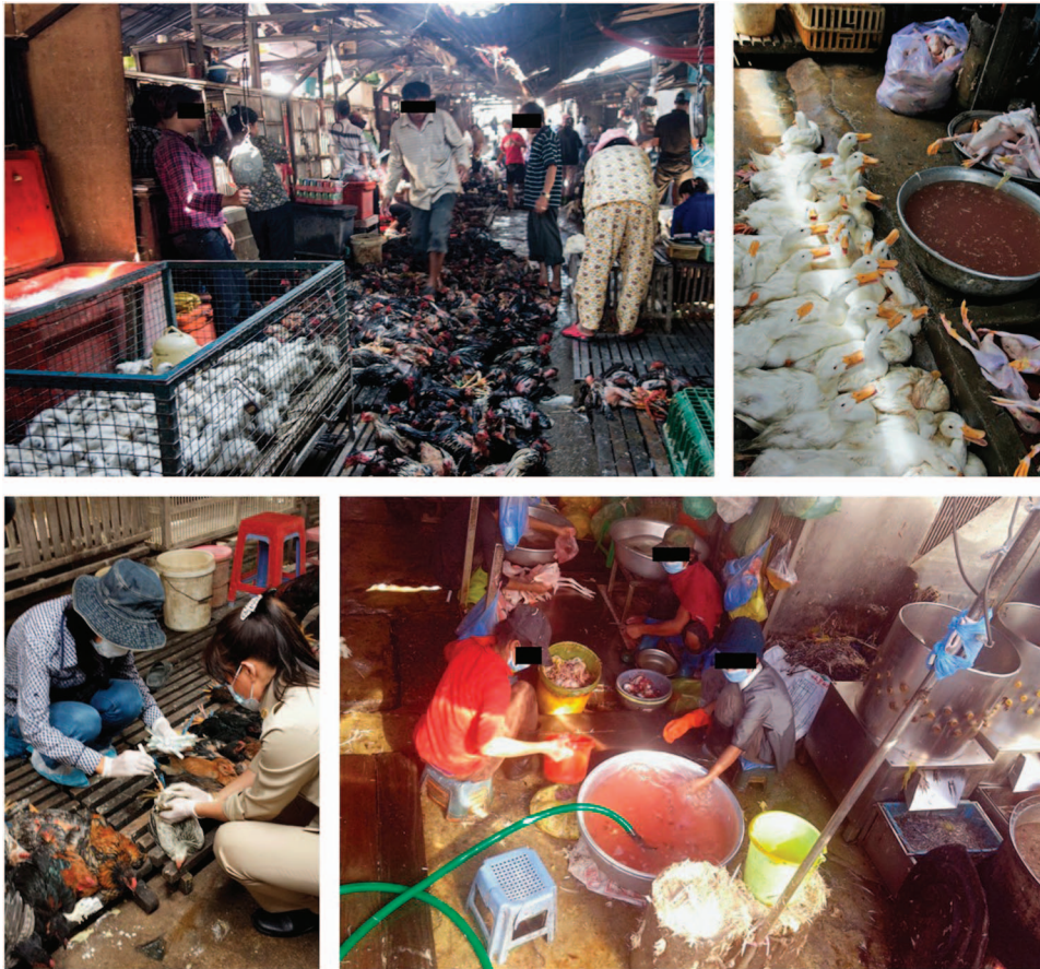
Figure 2 Live-bird markets in Cambodia typically have poor biosecurity, with multiple animal species slaughtered onsite. Animal and environmental sampling in these markets is crucial to monitor virus circulation and the emergence/introduction of new viruses.

RT-PCR typing assays were also applied to the original samples where isolation could not be achieved but discordance between M-gene and H5 qRT-PCR testing suggested the presence of a non-H5 AIV. The amplified RT-PCR products from isolates and original material were submitted to a commercial sequencing facility (Macrogen, Seoul, South Korea) for sequencing by the Sanger method. Full-genome sequences were generated from representative A/H5N1 isolates using methods previously described. 9,23