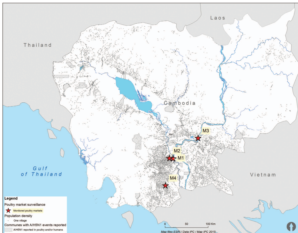
Figure 1 Map showing communes with reported confirmed human A/H5N1 cases during 2006–2014, population density (indicated by the number of villages) and live-bird markets investigated in 2013.

M-gene-positive samples, for which there was sufficient sample and high virus concentration (CT < 30; n = 78 ), were inoculated into specific pathogen-free embryonated chicken eggs for virus isolation. 21 Isolates were then tested using influenza universal multiplex RT-PCR assays to test for all known subtypes of influenza. 22 Universal multiplex