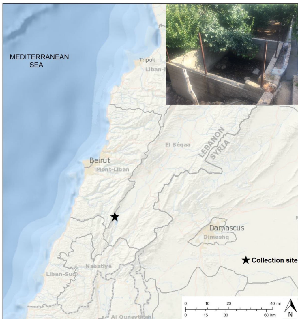
Fig 1. Map showing the geographic location of Lebanon East of the Mediterranean basin. This map indicates the site of mosquito egg collections in West Bekaa region. The map was modified using PowerPoint from http://landsatlook.usgs.gov/ (Credit: U.S. Geological Survey Department of the Interior/USGS—U.S. Geological Survey). Photo: breeding site (N. Haddad).

Culex egg rafts were sampled in June 2015 in Bab Mareh, in the West Bekaa district, a sub-humid, agricultural area in east of Lebanon with large stagnant water systems (Fig 1). Egg rafts