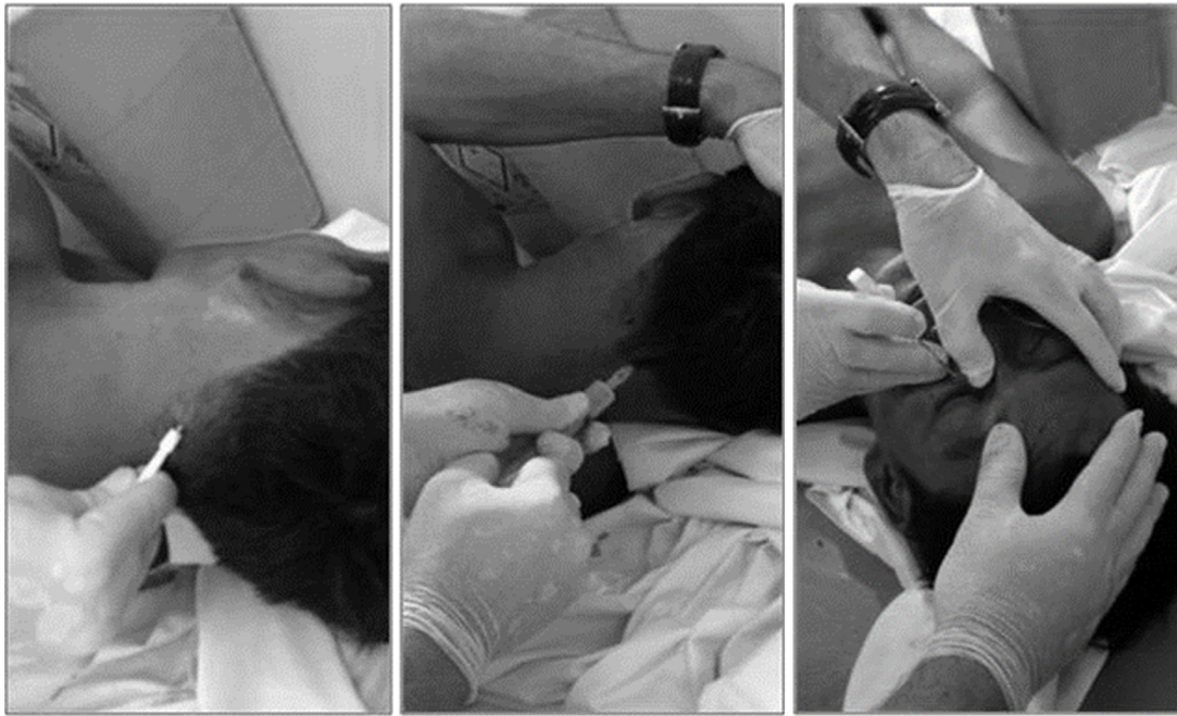
Figure 2. Minimally invasive tissue sampling techniques for rabies diagnosis in humans.

Brain samples can be frozen or preserved in 50% glycerol–saline solution if freezing is not readily available. 10,17,73 Samples should never be preserved in formalin. The reference laboratory must be contacted before the shipment of samples with suspected RABV. They should be sent in a double-enclosed waterproof container, with cooling material and absorbent material. All of these should be placed in a leak-proof outer container, in observance with national and International Air Transport Association (IATA) guidelines as ‘category B’ necessitating UN 3373/650 packaging (only RABV cultures are considered ‘category A’). 75,75 Sampling and shipping procedures must be well-established and communicated effectively to laboratory staff before they have to be put into use. Samples may be sent on filter paper at ambient temperature for easier shipment. 76,77 Filter paper such as FTA also has the advantage of inactivating RABV, reducing the hazard and facilitating shipment while preserving nucleic acids.