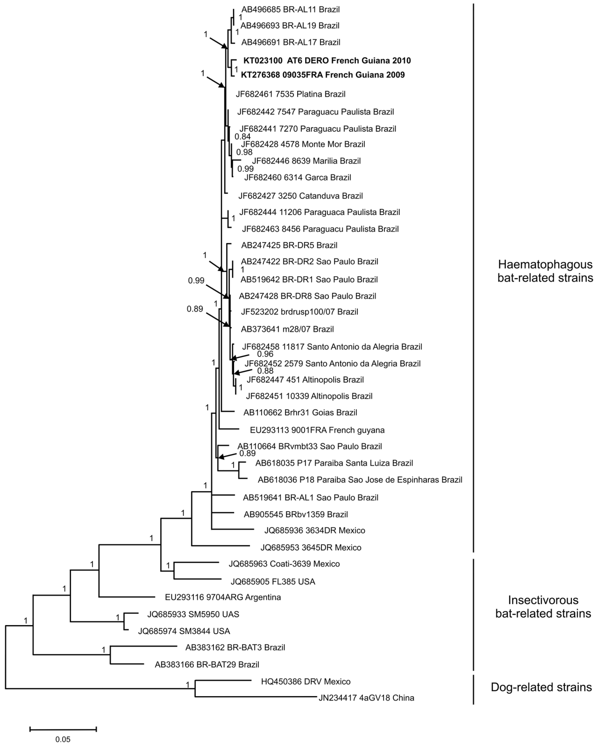
Fig 3. Phylogenetic tree constructed using Bayesian methods based on 1572 nucleotides of the complete glycoprotein gene. Virus names are associated with their accession numbers. Novel sequences generated from the two rabid bats in this study are shown in bold. Support for nodes is provided by the posterior probabilities of the corresponding clades. All resolved nodes have a posterior probability greater than 0.8. Scale bar indicates nucleotide sequence divergence among sequences.