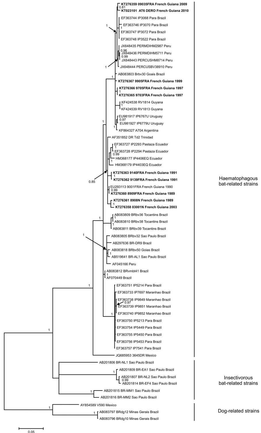
Fig 2. Phylogenetic tree constructed using Bayesian methods based on 1314 nucleotides of the nucleoprotein gene. Virus names are associated with their accession numbers. Novel sequences generated from the two rabid bats in this study are shown in bold. Support for nodes is provided by the posterior probabilities of the corresponding clades. All resolved nodes have a posterior probability greater than 0.8. Scale bar indicates nucleotide sequence divergence among sequences.