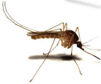
Wolbachia proposed as a mosquito control tool