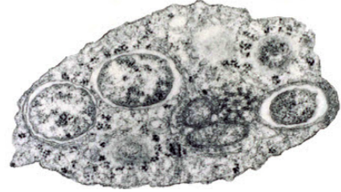
Identification of Wolbachia pipientis