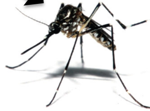
Life-shortening, DENV blocking Wolbachia strain in Ae. aegypti