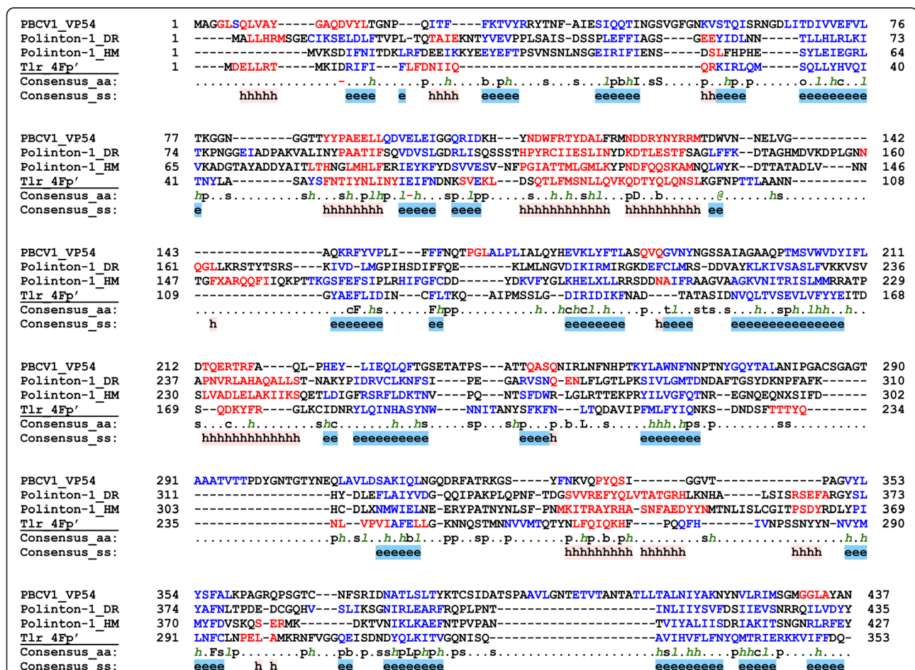
Figure 1 Multiple sequence alignment of the major capsid protein VP54 of PBCV-1 with the PY proteins of Polinton 1 from Danio rerio (DR), Polinton 1 from Hydra magnipapillata (HM), and protein 4Fp' from Tlr element. The last two lines in each block show consensus amino acid sequence (Consensus_aa) and consensus predicted secondary structures (Consensus_ss). The protein sequences are colored according to predicted secondary structures (red: alpha-helix, blue: beta-strand). Consensus predicted secondary structure symbols: alpha-helix: h; beta-strand: e. Consensus amino acid symbols are: conserved amino acids are in uppercase letters; aliphatic (I, V, L): l; aromatic (Y, H, W, F): @; hydrophobic (W, F, Y, M, L, I, V, A, C, T, H): h; alcohol (S, T): o; polar residues (D, E, H, K, N, Q, R, S, T): p; tiny (A, G, C, S): t; small (A, G, C, S, V, N, D, T, P): s; bulky residues (E, F, I, K, L, M, Q, R, W, Y): b; positively charged (K, R, H): +; negatively charged (D, E): -; charged (D, E, K, R, H): c.

We next assessed the conservation of the Polinton MCP-coding genes and found that 46 of the 72 Polintons in the analyzed representative set encoded full-length MCPs (Additional file 1: Table S1), whereas in 13 other polintons the MCP-coding genes were split. Thus, more than 80% of the Polintons contain recognizable intact or fragmented MCP genes. This high conservation of the MCP proteins mirrors the conservation of the FtsK-like ATPase and cysteine protease (PRO), the two other viral-like proteins encoded by Polintons. The Polinton ATPase belongs to the family of genome-packaging ATPases of viruses with DJR MCPs [15,16], whereas PRO is homologous to the virion maturation protease encoded by adenoviruses, virophages and many Nucleocytoplasmic Large DNA Viruses (NCLDV) of