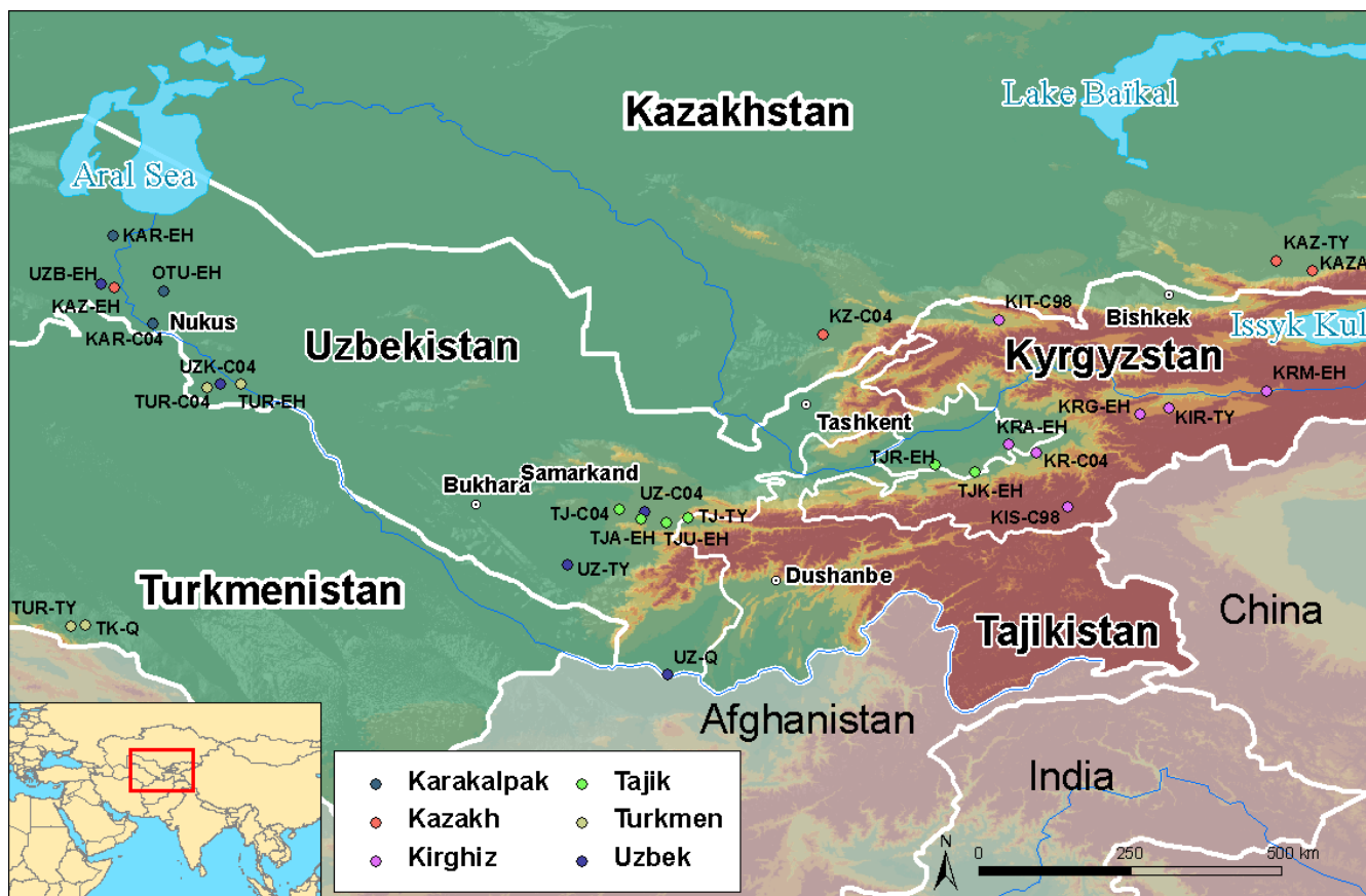
Figure 2 Geographic map of the sampled area.

Y chromosome diversity was assessed using a set of microsatellites, since these are variable in all populations and avoid the possible ascertainment bias associated with Y-SNPs. We typed 12 microsatellites on the Y chromosome, but for comparison with previous studies, we present the result for only seven of these. According to the protocol described by [16], we genotyped and analysed the microsatellites DYS388, DYS389I, DYS392, DYS19, DYS390, DYS391 and DYS393.